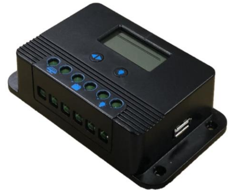
TP-SC24-20 Solar Charge Controller