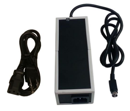
180W DIN Connector Model