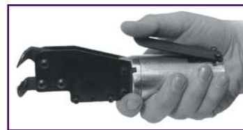
Hand Air Tool-HAT Series