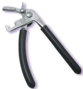
Part No. 0020