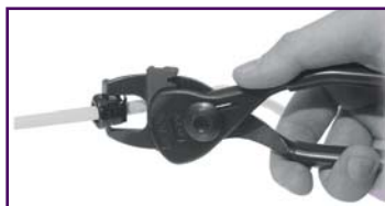
Part Nos. 0022 and 0030

Part No. 0T02 Conversion Kit provides the necessary components to convert a hand air tool to a bench mounted unit. The bench air tool can be mounted in any convenient position on the assembly area work surface. Unit is foot activated, leaving the operator's hands free.