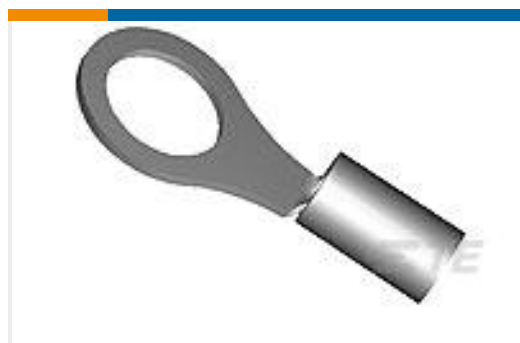
TE Model / Part #165405 P.G. RING DIN