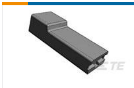
TE Model / Part #154509-2 FASTON 250 REC HSG PP NAT