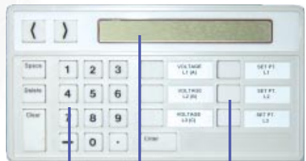
Numeric Keypad for Data Entry