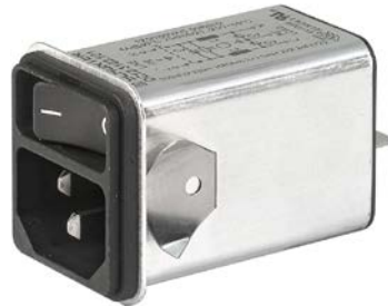
Snap-in version from front side