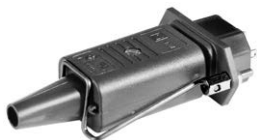
Cord retaining kits Cord retaining strain relief