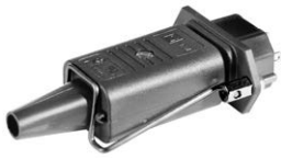
Cord retaining kits Cord retaining strain relief