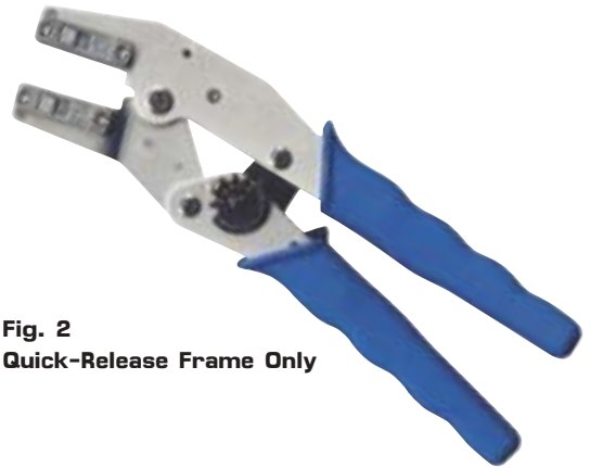
Fig. 2 Quick-Release Frame Only