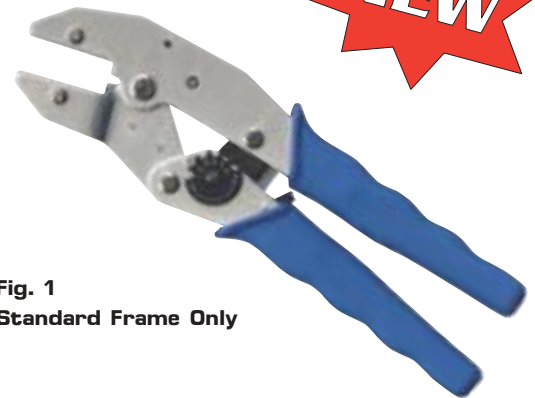
Fig. 1 Standard Frame Only