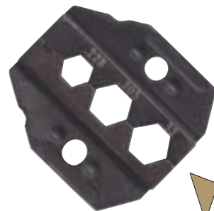
Fig. 4 Die Set