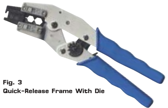
Fig. 3 Quick-Release Frame With Die