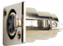
XLR (F) Panel Receptacle, 3 Contacts, Nickel-plated Zinc 5113A