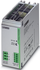
Primary-switched TRIO POWER power supply for DIN rail mounting, input: 1-phase, output: 48 V DC/5 A

Please be informed that the data shown in this PDF Document is generated from our Online Catalog. Please find the complete data in the user's documentation. Our General Terms of Use for Downloads are valid ( http://phoenixcontact.com/download )