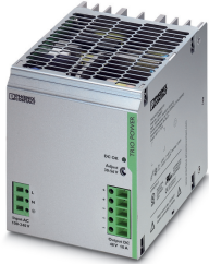
Primary-switched TRIO POWER power supply for DIN rail mounting, input: 1-phase, output: 48 V DC/10 A

Please be informed that the data shown in this PDF Document is generated from our Online Catalog. Please find the complete data in the user's documentation. Our General Terms of Use for Downloads are valid ( http://phoenixcontact.com/download )