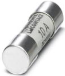
Fuse, 10.3x38 mm, up to 1000 V DC, gPV characteristics

Please be informed that the data shown in this PDF Document is generated from our Online Catalog. Please find the complete data in the user's documentation. Our General Terms of Use for Downloads are valid ( http://phoenixcontact.com/download )