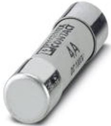
Fuse, 10.3x38 mm, up to 1000 V DC, gPV characteristics

Please be informed that the data shown in this PDF Document is generated from our Online Catalog. Please find the complete data in the user's documentation. Our General Terms of Use for Downloads are valid ( http://phoenixcontact.com/download )