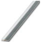
Continuous plug-in bridge, mounting type: Plug-in mounting, Color: gray

Continuous plug-in bridge - FBST 500 TMC-N GY - 0901028