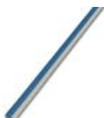
Continuous plug-in bridge, length: 500 mm, color: blue

Continuous plug-in bridge - FBST 500-PLC BU - 2966692