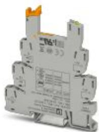
6.2 mm PLC basic terminal block with screw connection, without relay or solid-state relay, for mounting on DIN rail NS 35/7,5, 1 PDT, input voltage 12 V DC

Please be informed that the data shown in this PDF Document is generated from our Online Catalog. Please find the complete data in the user's documentation. Our General Terms of Use for Downloads are valid ( http://phoenixcontact.com/download )