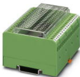
Lamp test module, 2 diodes with common cathode: with 16 pairs, with common triggering

Please be informed that the data shown in this PDF Document is generated from our Online Catalog. Please find the complete data in the user's documentation. Our General Terms of Use for Downloads are valid ( http://phoenixcontact.com/download )