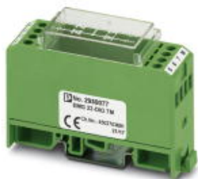
Diode module, with 7 diodes, common anode, diode type 1N 4007

Please be informed that the data shown in this PDF Document is generated from our Online Catalog. Please find the complete data in the user's documentation. Our General Terms of Use for Downloads are valid ( http://phoenixcontact.com/download )