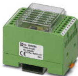
Diode module, with eight diodes, can be individually wired, diode type 1N 5408

Please be informed that the data shown in this PDF Document is generated from our Online Catalog. Please find the complete data in the user's documentation. Our General Terms of Use for Downloads are valid ( http://phoenixcontact.com/download )