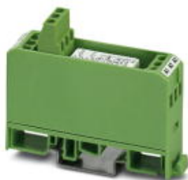
Relay module, with soldered-in miniature switching relay, contact (AgNi+Au): Small to large loads, 2 PDT, 24 V AC/DC input voltage

Please be informed that the data shown in this PDF Document is generated from our Online Catalog. Please find the complete data in the user's documentation. Our General Terms of Use for Downloads are valid ( http://phoenixcontact.com/download )