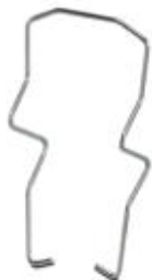
Relay retaining bracket, wire model, suitable for RIF-1 relay base, for 25 mm high octal miniature power relays

Please be informed that the data shown in this PDF Document is generated from our Online Catalog. Please find the complete data in the user's documentation. Our General Terms of Use for Downloads are valid ( http://phoenixcontact.com/download )