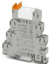
PLC-INTERFACE, hybrid solid-state relay incl. bypass relay with screw connection, for mounting on NS 35/7,5 DIN rail, input: 24 V DC, output: 24 V AC - 253 V AC/10 A

Please be informed that the data shown in this PDF Document is generated from our Online Catalog. Please find the complete data in the user's documentation. Our General Terms of Use for Downloads are valid ( http://phoenixcontact.com/download )