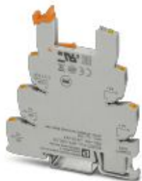
6.2 mm PLC basic terminal block with push-in connection, without relay or solid-state relay, for mounting on DIN rail NS 35/7,5, 1 PDT, input voltage 5 V DC

Please be informed that the data shown in this PDF Document is generated from our Online Catalog. Please find the complete data in the user's documentation. Our General Terms of Use for Downloads are valid ( http://phoenixcontact.com/download )