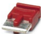
Single plug-in bridge, length: 6 mm, number of positions: 2, color: red

Single plug-in bridge - FBST 6-PLC RD - 2966236