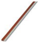
Continuous plug-in bridge, length: 500 mm, color: red

Continuous plug-in bridge - FBST 500-PLC RD - 2966786