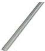
Continuous plug-in bridge, length: 500 mm, color: gray

Continuous plug-in bridge - FBST 500-PLC GY - 2966838