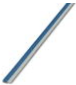
Continuous plug-in bridge, length: 500 mm, color: blue

Continuous plug-in bridge - FBST 500-PLC BU - 2966692