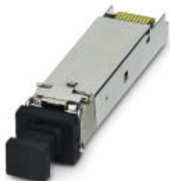
Gigabit SFP module for transmission up to 30 km with a wavelength of 1310 nm.

Please be informed that the data shown in this PDF Document is generated from our Online Catalog. Please find the complete data in the user's documentation. Our General Terms of Use for Downloads are valid ( http://phoenixcontact.com/download )