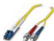
Single-mode OS2 duplex jumper, LC-ST, UPC polishing, length 1 m

FO patch cable - FOC-LC:PA-ST:PA-OS2:D01/1 - 1115596