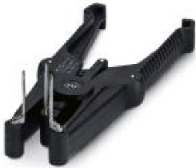
Assembly tool for FL IP 54 SPOUT

Please be informed that the data shown in this PDF Document is generated from our Online Catalog. Please find the complete data in the user's documentation. Our General Terms of Use for Downloads are valid ( http://phoenixcontact.com/download )