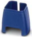
Color marking for patch cable, blue

Color-coding - FL PATCH CCODE BU - 2891291