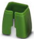
Color marking for patch cable, green

Color-coding - FL PATCH CCODE GN - 2891796