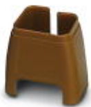
Color marking for patch cable, brown

Color-coding - FL PATCH CCODE BN - 2891495