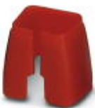
Color marking for patch cable, red

Color-coding - FL PATCH CCODE RD - 2891893