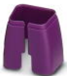
Color marking for patch cable, purple

Color-coding - FL PATCH CCODE VT - 2891990