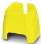
Color marking for patch cable, yellow

Color-coding - FL PATCH CCODE YE - 2891592