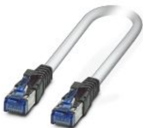
Patch cable, CAT6, pre-assembled, 0.5 m

Please be informed that the data shown in this PDF Document is generated from our Online Catalog. Please find the complete data in the user's documentation. Our General Terms of Use for Downloads are valid ( http://phoenixcontact.com/download )