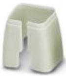
Color marking for patch cable, gray

Color-coding - FL PATCH CCODE GY - 2891699