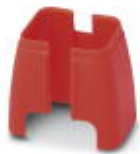
Security element for FL patch cable

Port Guard Security Element - FL PATCH SAFE CLIP - 2891246