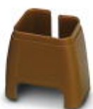
Color marking for patch cable, brown

Color-coding - FL PATCH CCODE BN - 2891495