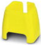
Color marking for patch cable, yellow

Color-coding - FL PATCH CCODE YE - 2891592