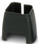
Color marking for patch cable, black

Color-coding - FL PATCH CCODE BK - 2891194