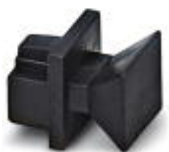
Dust protection caps for RJ45 socket

Dust protection - FL RJ45 PROTECT CAP - 2832991