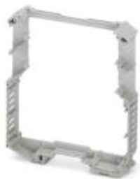
DIN rail housing, Intermediate element, width: 17.6 mm, height: 99 mm, depth: 112.85 mm, color: light gray (7035)

Please be informed that the data shown in this PDF Document is generated from our Online Catalog. Please find the complete data in the user's documentation. Our General Terms of Use for Downloads are valid ( http://phoenixcontact.com/download )