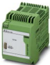
Energy storage device, lead AGM, VRLA technology, 12 V DC, 1.6 Ah.

Please be informed that the data shown in this PDF Document is generated from our Online Catalog. Please find the complete data in the user's documentation. Our General Terms of Use for Downloads are valid ( http://phoenixcontact.com/download )