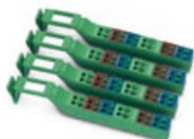
Connector set, for IB IL DI 16, copper, colored identification.

Please be informed that the data shown in this PDF Document is generated from our Online Catalog. Please find the complete data in the user's documentation. Our General Terms of Use for Downloads are valid ( http://phoenixcontact.com/download )