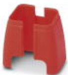
Security element for FL patch cable

Port Guard Security Element - FL PATCH SAFE CLIP - 2891246