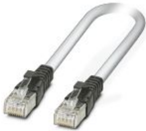
Patch cable, CAT5, assembled, 0.5 m

Please be informed that the data shown in this PDF Document is generated from our Online Catalog. Please find the complete data in the user's documentation. Our General Terms of Use for Downloads are valid ( http://phoenixcontact.com/download )