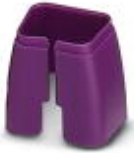
Color marking for patch cable, purple

Color-coding - FL PATCH CCODE VT - 2891990