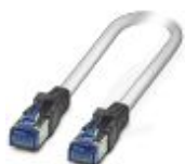
Patch cable, CAT6, pre-assembled, 12.5 m

Patch cable - FL CAT6 PATCH 12,5 - 2891369