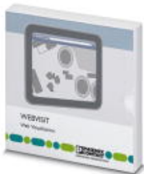
Upgrade license for upgrading from WebVisit 6 Basic to WebVisit 6 Pro

Please be informed that the data shown in this PDF Document is generated from our Online Catalog. Please find the complete data in the user's documentation. Our General Terms of Use for Downloads are valid ( http://phoenixcontact.com/download )