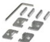
HMI mounting kit for installation on a front plate. The mounting kit includes 8 x mounting brackets, 8 x screw threads, and a hexagonal wrench.

Mounting material - HMI SCB MOUNTING KIT 8 - 2701387