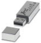
USB memory stick, 8 GB

USB memory stick - USB FLASH DRIVE - 2402809