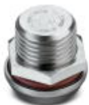
Plug, M20, for FB... enclosure