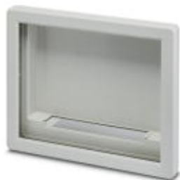
Display housing, 15", light gray, central window, front level, with cutout for connection technology angle plate consisting of two half shells with screws

Please be informed that the data shown in this PDF Document is generated from our Online Catalog. Please find the complete data in the user's documentation. Our General Terms of Use for Downloads are valid ( http://phoenixcontact.com/download )