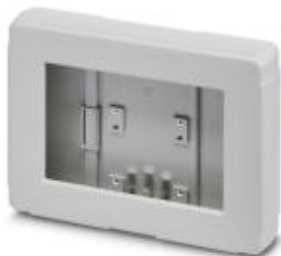
Display housing, 7", light gray, central window, front level, for battery pack consisting of two half shells, with screws and battery pack contacts

Please be informed that the data shown in this PDF Document is generated from our Online Catalog. Please find the complete data in the user's documentation. Our General Terms of Use for Downloads are valid ( http://phoenixcontact.com/download )