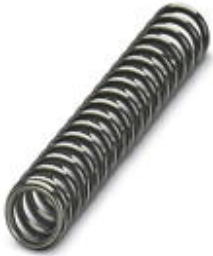
Coil spring for Lock & Release lever for ME-IO housing

Please be informed that the data shown in this PDF Document is generated from our Online Catalog. Please find the complete data in the user's documentation. Our General Terms of Use for Downloads are valid ( http://phoenixcontact.com/download )