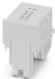
DIN rail housing, 2U for marking lid, Housing cover, width: 18.9 mm, height: 21.9 mm, depth: 26 mm, color: light gray (7035)

Please be informed that the data shown in this PDF Document is generated from our Online Catalog. Please find the complete data in the user's documentation. Our General Terms of Use for Downloads are valid ( http://phoenixcontact.com/download )