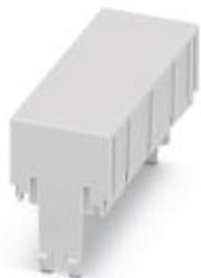
DIN rail housing, 4U, Housing cover, width: 18.9 mm, height: 43.8 mm, depth: 26 mm, color: light gray (7035)

Please be informed that the data shown in this PDF Document is generated from our Online Catalog. Please find the complete data in the user's documentation. Our General Terms of Use for Downloads are valid ( http://phoenixcontact.com/download )