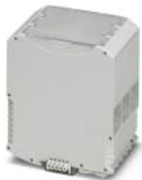
DIN rail housing, Complete housing with metal foot catch, tall design, without vents, width: 67.5 mm, height: 99 mm, depth: 114.5 mm, color: light gray (7035)

Please be informed that the data shown in this PDF Document is generated from our Online Catalog. Please find the complete data in the user's documentation. Our General Terms of Use for Downloads are valid ( http://phoenixcontact.com/download )