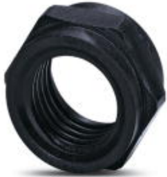
Photovoltaic connector, Range of articles: PV-JB TF, Nut, number of positions: 0

Please be informed that the data shown in this PDF Document is generated from our Online Catalog. Please find the complete data in the user's documentation. Our General Terms of Use for Downloads are valid ( http://phoenixcontact.com/download )