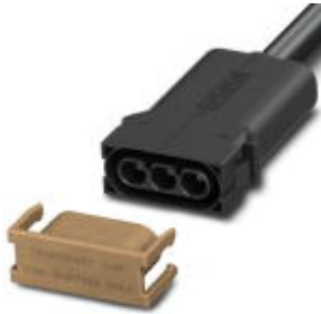
SUNCLIX micon mains connector for the socket side, 3-pos., IP67, 20 A, 600 V, trunk line: 1.0 m, incl. dust protection cap, North American version

Please be informed that the data shown in this PDF Document is generated from our Online Catalog. Please find the complete data in the user's documentation. Our General Terms of Use for Downloads are valid ( http://phoenixcontact.com/download )