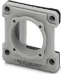
RJ45 panel mounting frame, IP67, for modular socket inserts (Keystone), for square panel cutout, with grommet, without mounting screws, color: gray

Please be informed that the data shown in this PDF Document is generated from our Online Catalog. Please find the complete data in the user's documentation. Our General Terms of Use for Downloads are valid ( http://download.phoenixcontact.com )