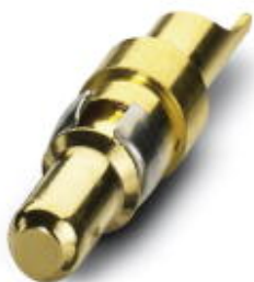
Power contacts, for D-SUB combination inserts, pin, solder cup, straight, rated current 20 A, gold-plated

Please be informed that the data shown in this PDF Document is generated from our Online Catalog. Please find the complete data in the user's documentation. Our General Terms of Use for Downloads are valid ( http://phoenixcontact.com/download )