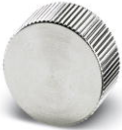
Metal protection cap for connectors with M17 external thread

Please be informed that the data shown in this PDF Document is generated from our Online Catalog. Please find the complete data in the user's documentation. Our General Terms of Use for Downloads are valid ( http://phoenixcontact.com/download )